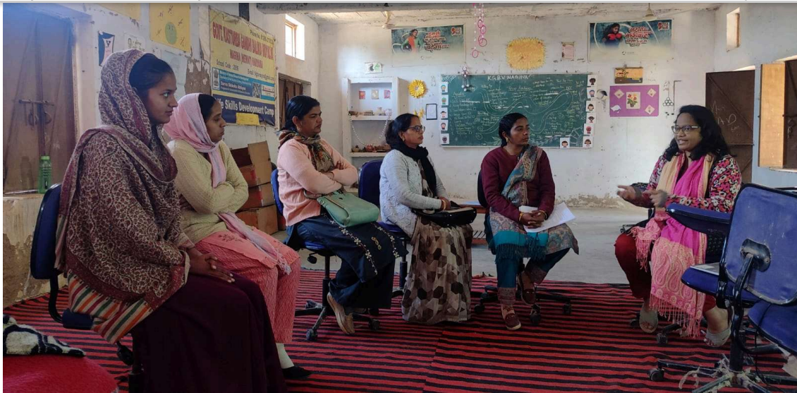
Cluster Session 3 with Teachers and Wardens in KGBV Nagina