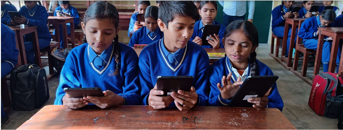
During Need Assessment Survey in KGBV Hisar