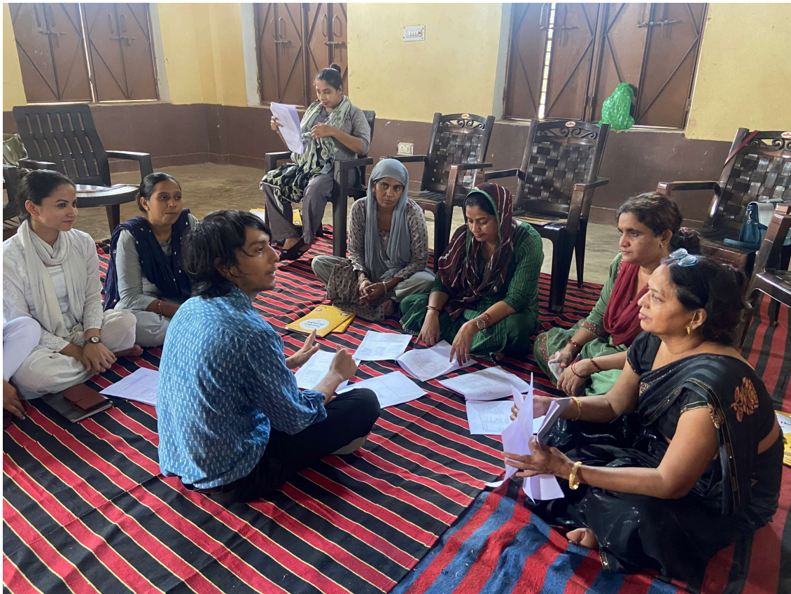
Cluster Session 2 with Teachers and Wardens in KGBV Jhirka