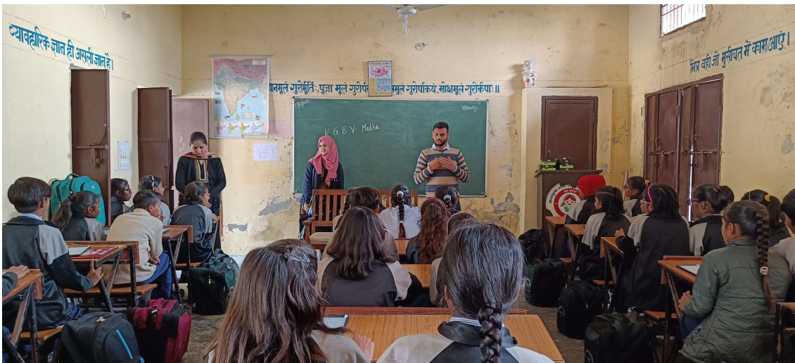
Team members giving Baseline instructions to Girls