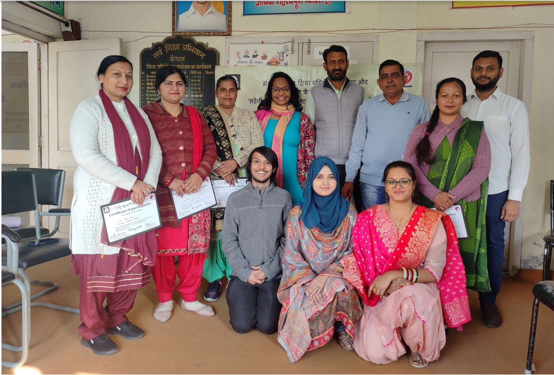
After the Orientation Workshop in Kaithal district