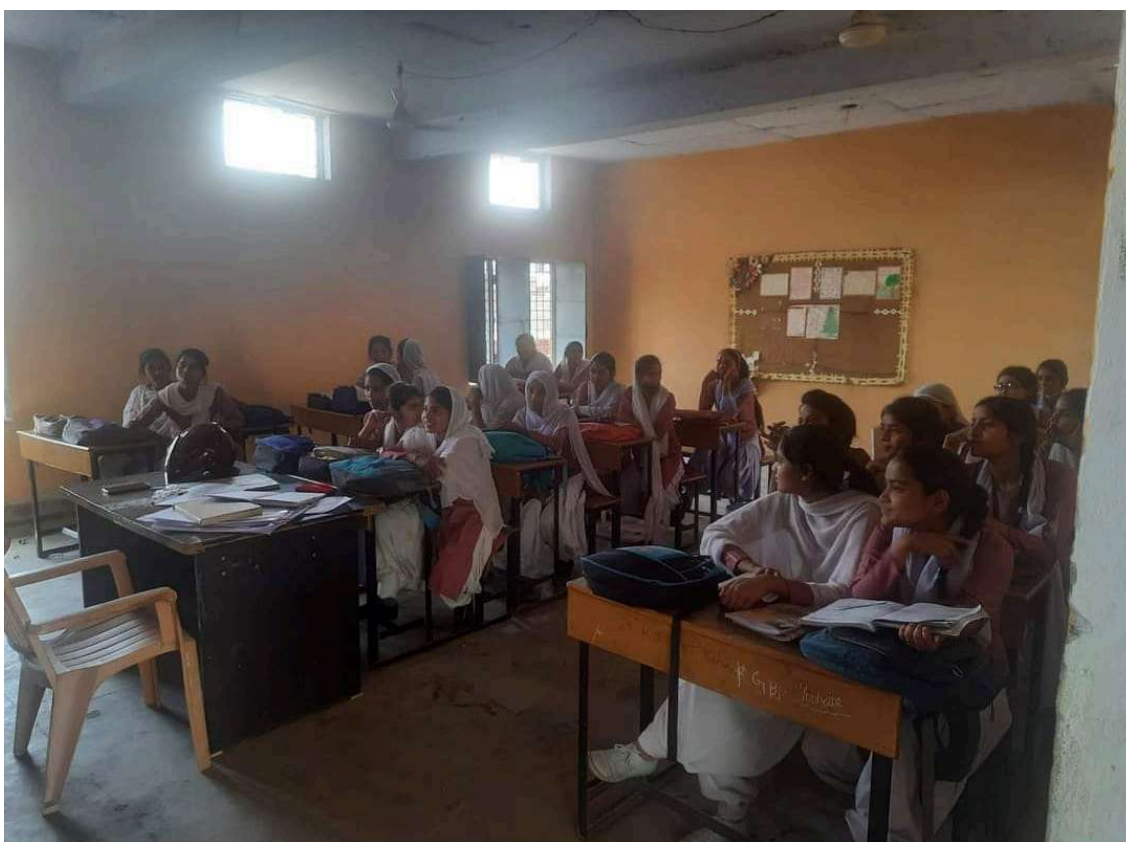
Girls during class hours- KGBV Punhana