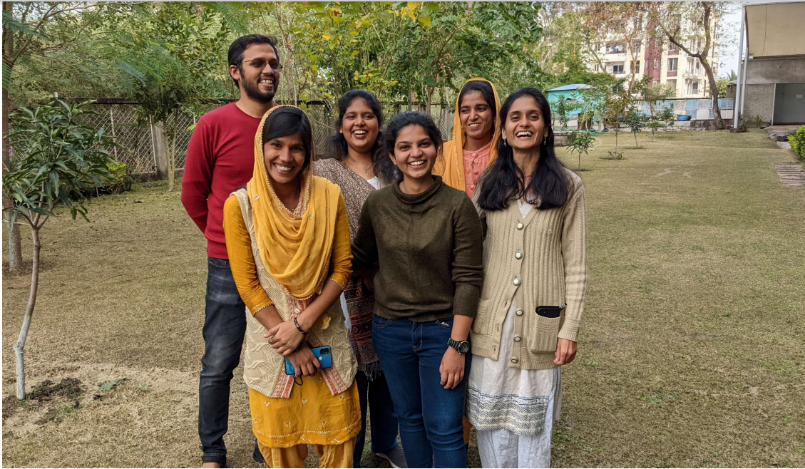
Team members photograph post Step Back 2021-22